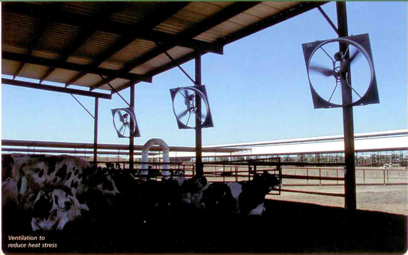
Ventilation to reduce heat stress