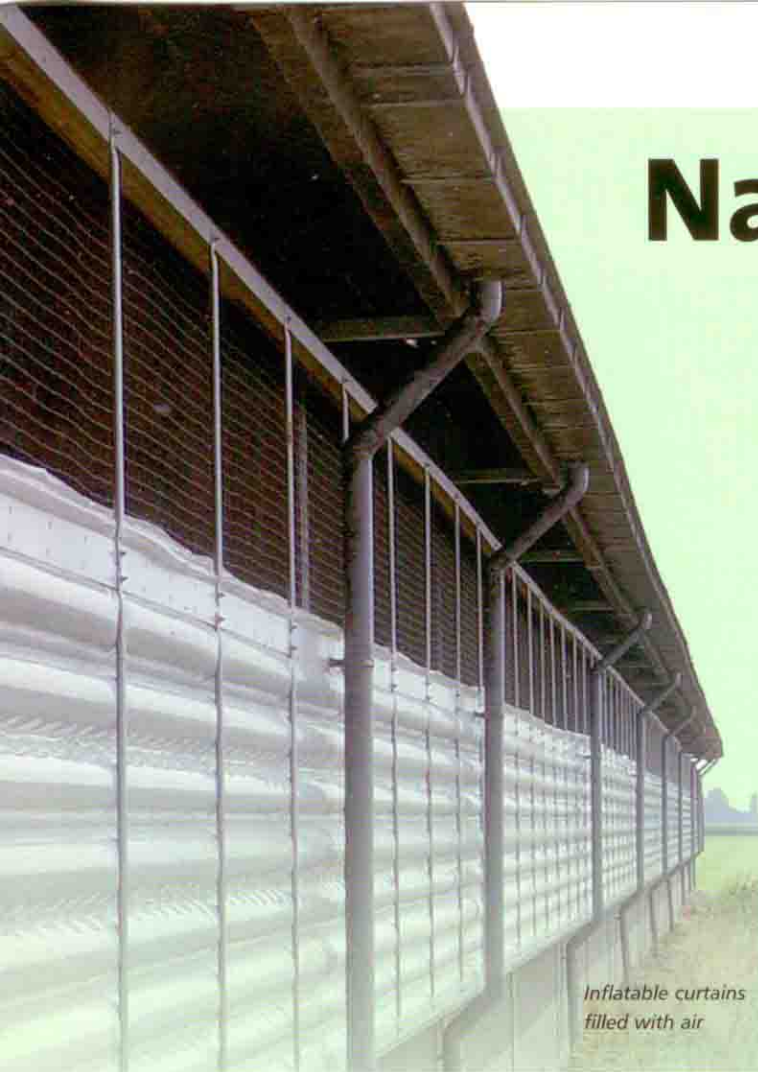
Inflatable curtains filled with air