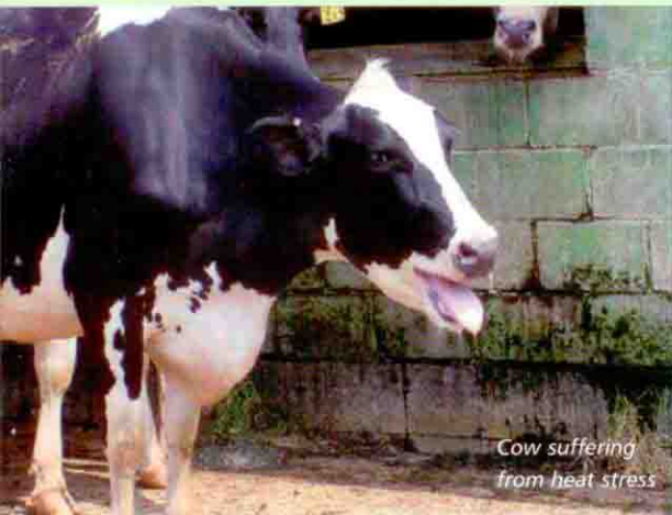
Cow suffering from heat stress